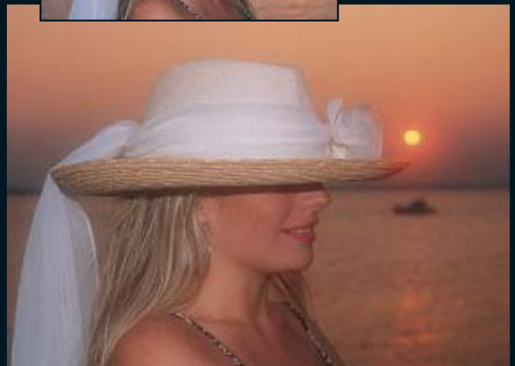
Warm Black Pro-Mist 4