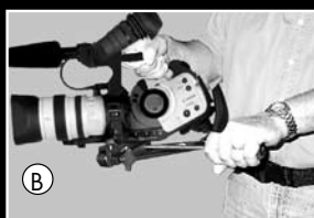
B. Handle can be mounted on either side of camera for easy maneuverability.