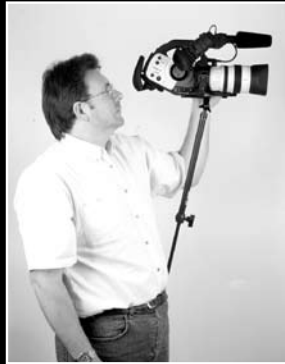
High Angle Views

TAKES THE WEIGHT OFF YOUR SHOULDERS FOR TOTAL EASE AND COMFORT