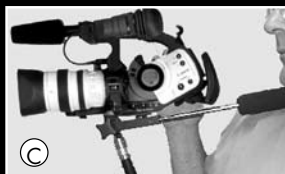
C. Handle adds additional support when attached as shoulder rest.