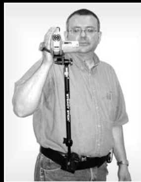
Eye Level Shots