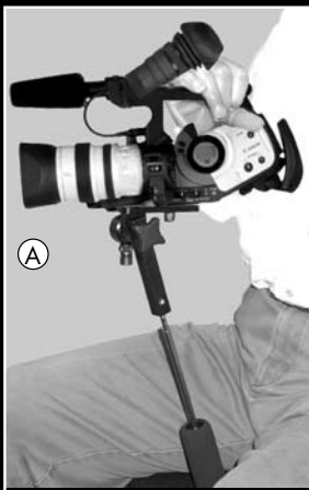
A. Handle turns into 14" monopod. Great for stabilizing shots when sitting.