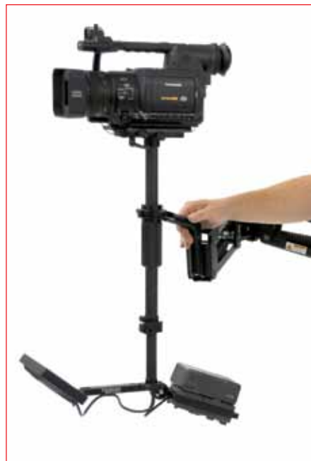
(ABOVE) The Flyer-LE with the Panasonic P2 camera complement each other perfectly.