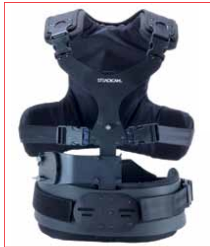
(ABOVE) Flyer-LE Vest.