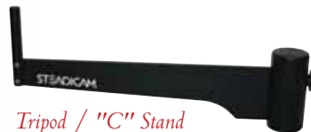
Tripod / "C" Stand Docking Bracket

Covered by U. S. patents 5,435,515, 5,360,196, 7,625,090 and pending foreign patents. Additional patents pending. Steadicam reserves the right to change specifications without prior notice.