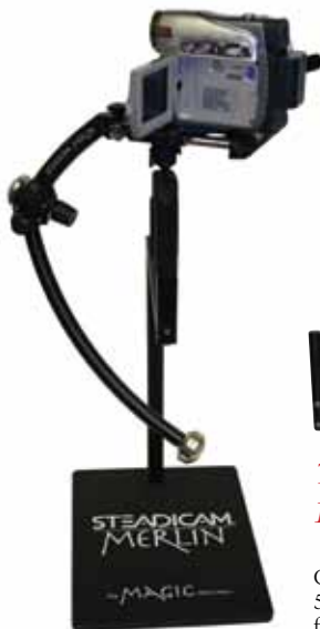
Table Top Stand