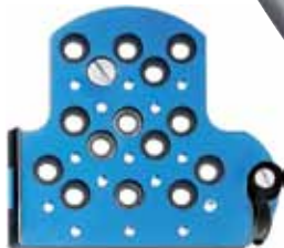
rapid-mounting locking dovetail plate