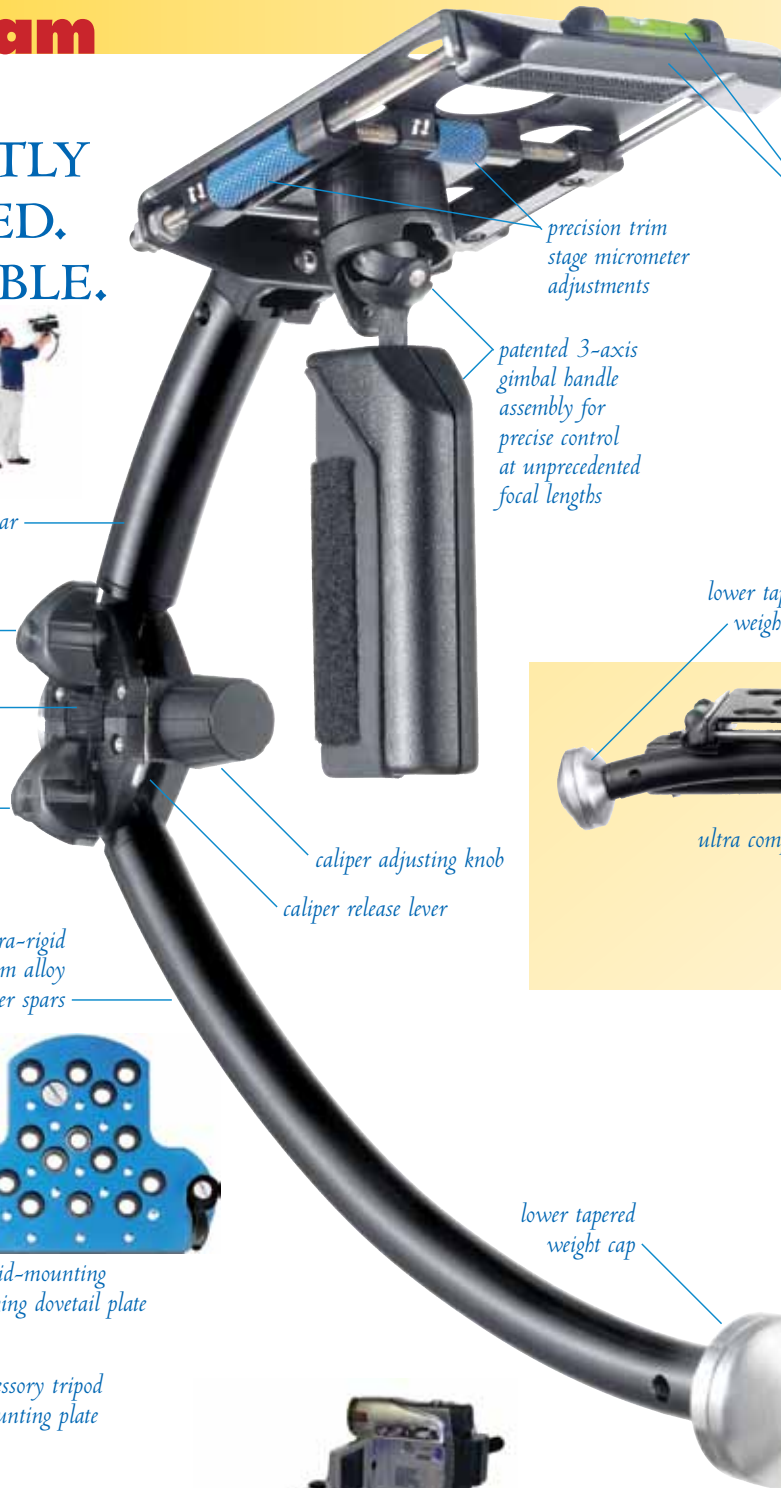
precision trim stage micrometer adjustments

Covered by U. S. patents 5,435,515, 5,360,196, 7,625,090 and pending foreign patents. Additional patents pending. Steadicam reserves the right to change specifications without prior notice.