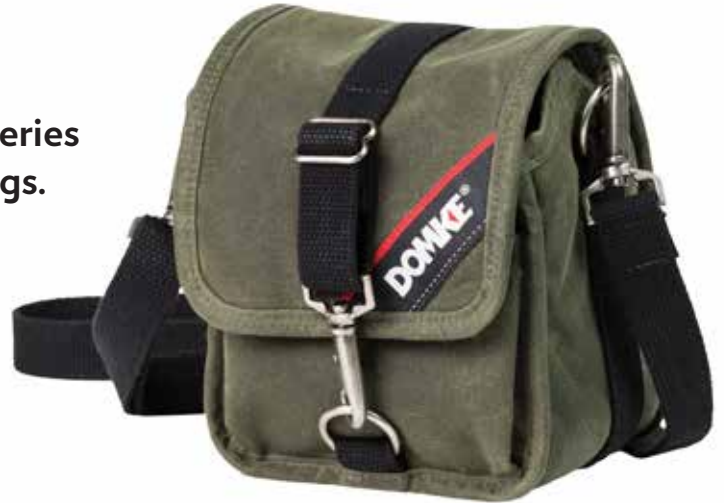
A-TREKK-RM Ruggedwear® - Military/Black