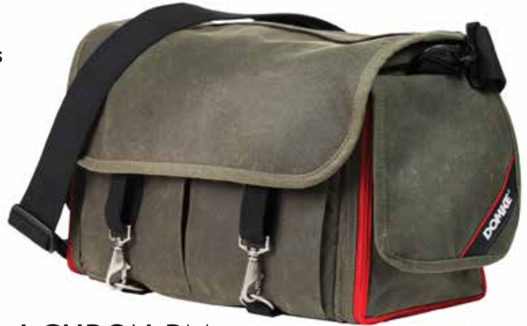
J-CHRON-RM Ruggedwear® - Military/Black