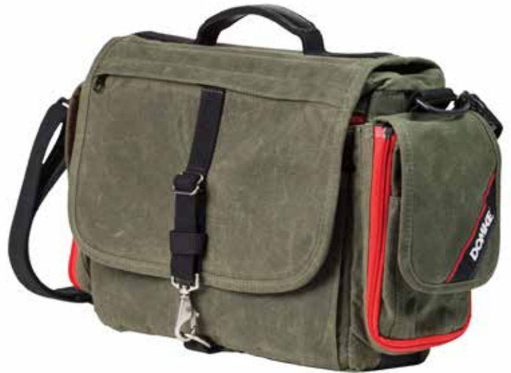
J-HERAL-RM Ruggedwear® - Military/Black