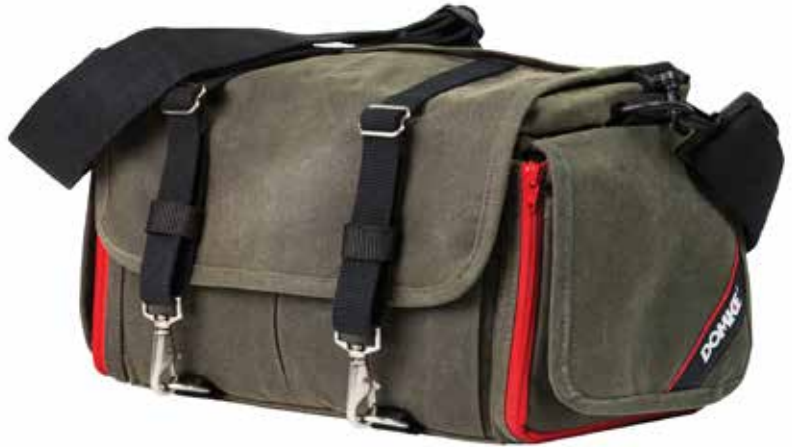
J-LEDGE-RM Ruggedwear®- Military/Black