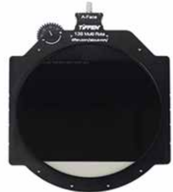
4565MULTROTTRAVND (shown as VND)