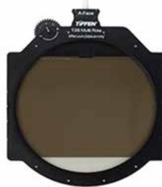
4565MULTROTTRAVND (shown as Warm/Cool FX in Warm)