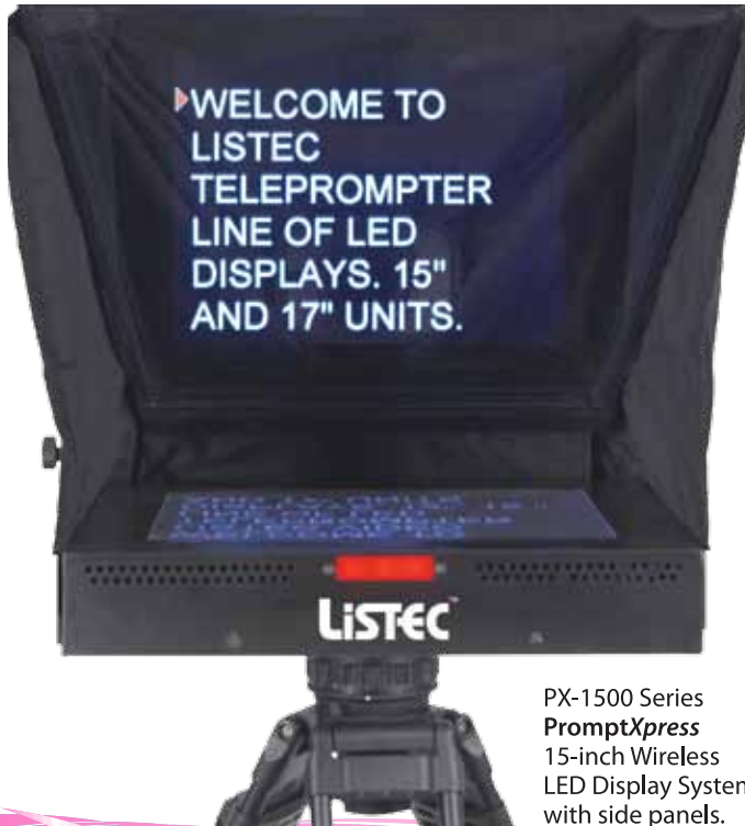
PX-1500 Series PromptXpress 15-inch Wireless LED Display System with side panels.