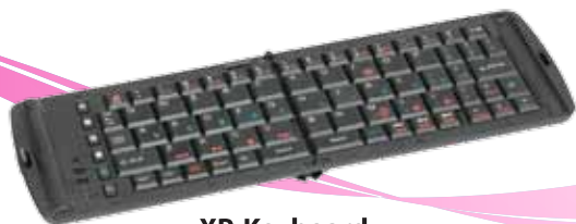
XP-Keyboard Bluetooth folding QWERTY keyboard with case.