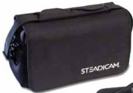
Merlin 2 ® DSLR Camera Bag